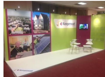
A branded floor.