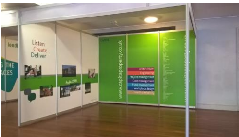
Example image of panelled graphics installed in a 3m x 3m open ended stand.

Full details and a bespoke quote for your exact stand can be obtained by emailing Abi our Event Sales Executive on exhibitionorders@wce.co.uk