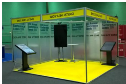
Branded wall panels

Please note full remittance for additional opportunities must be received by Friday 22 nd June 2018